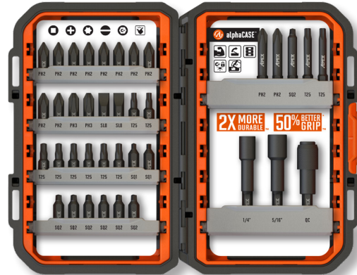
AMSET-38 | 38 Piece Fastening Set