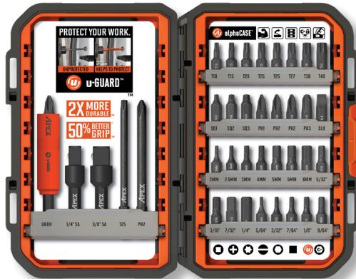
AUGSET-38 | 38 Piece u-Guard™ Fastening Set