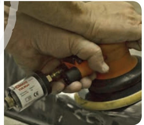
Run time monitoring for consumable use or process efficiency