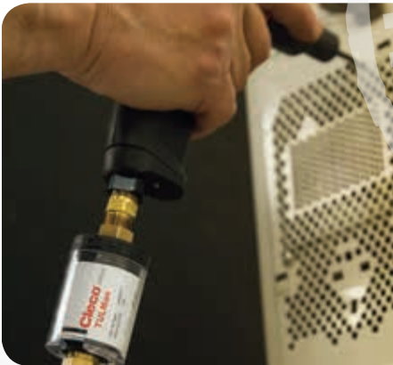
Cycle monitoring for calibration and service