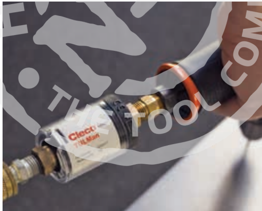
Run time monitoring for performance checking and service