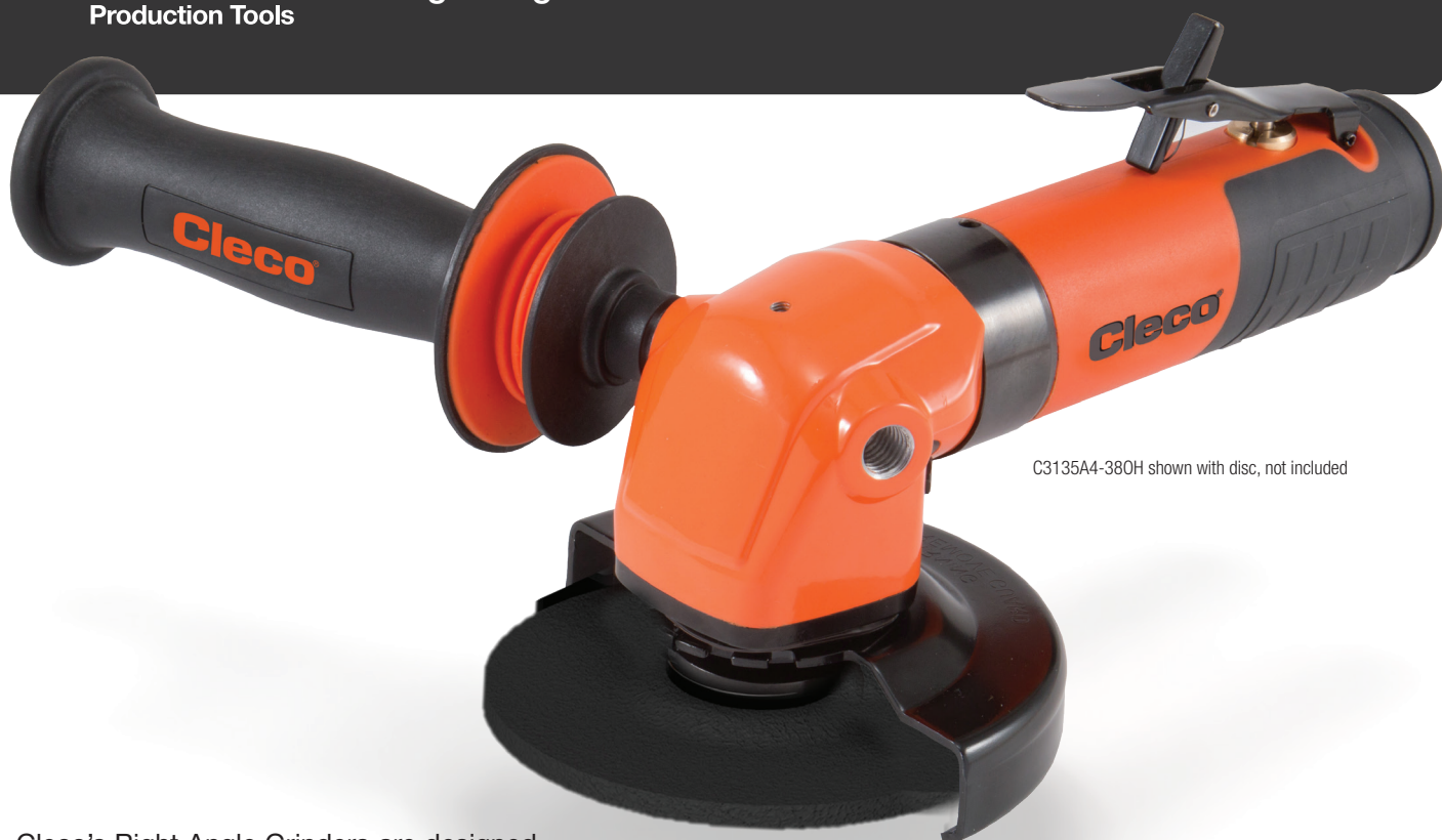
C3135A4-380H shown with disc, not included

Cleco's Right Angle Grinders are designed for rigorous use and long life, containing the features and power that are perfect for the most demanding applications found in foundries, shipyards, machine shops and rail car manufacturing.